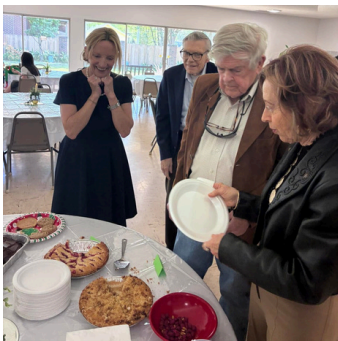
Pictured: Enjoying God’s abundance and great fellowship at the 5 th Sunday Potluck