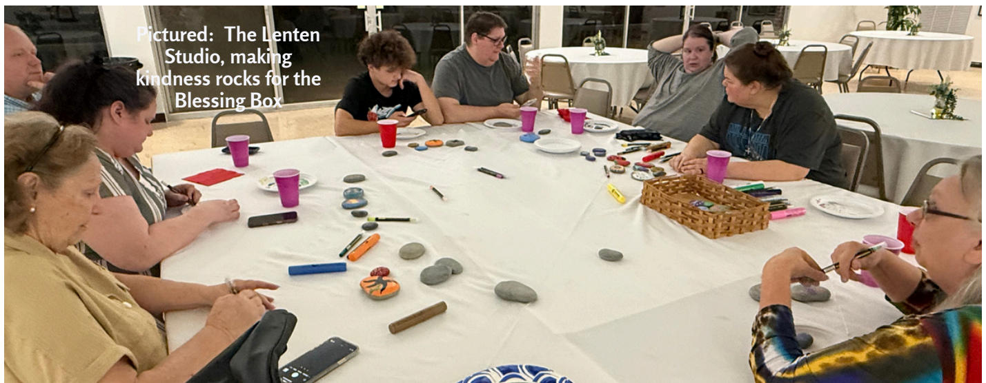
Pictured: The Lenten Studio, making kindness rocks for the Blessing Box

Healing is available after worship on Sundays or by appointment. Confession is by appointment.