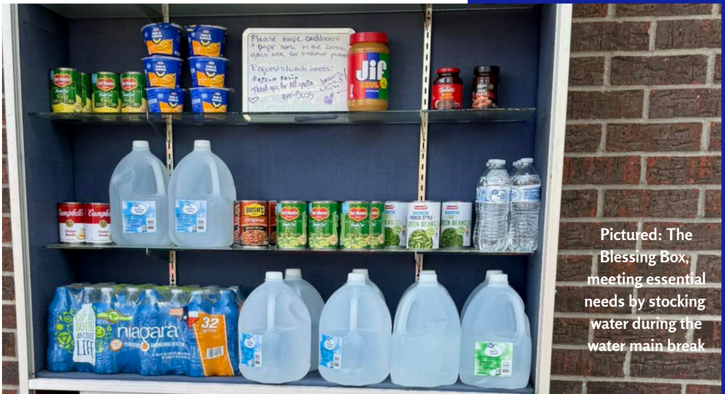
Pictured: The Blessing Box, meeting essential needs by stocking water during the water main break

members, and supporting gatherings that deepen our sense of belonging. From coordinating activities to dreaming up ways we can spend meaningful time together, the Minister for Congregational Life helps ensure that no one slips through the cracks.