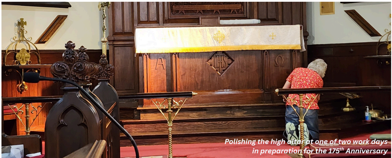
Polishing the high altar at one of two work days in preparation for the 175 th Anniversary

Healing is available after worship on Sundays or by appointment. Confession is by appointment.